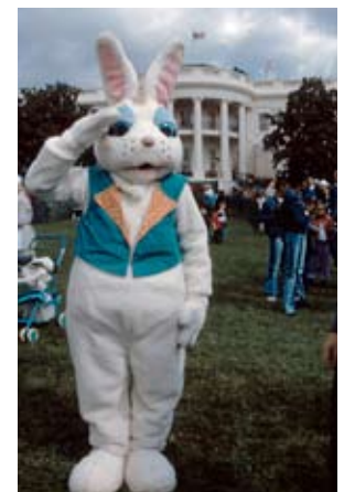
(l to r) Easter Monday on the White House grounds, 1887, Children with Maypole at Egg Roll, c. 1920, Easter Bunny salutes officers in parade, 2002