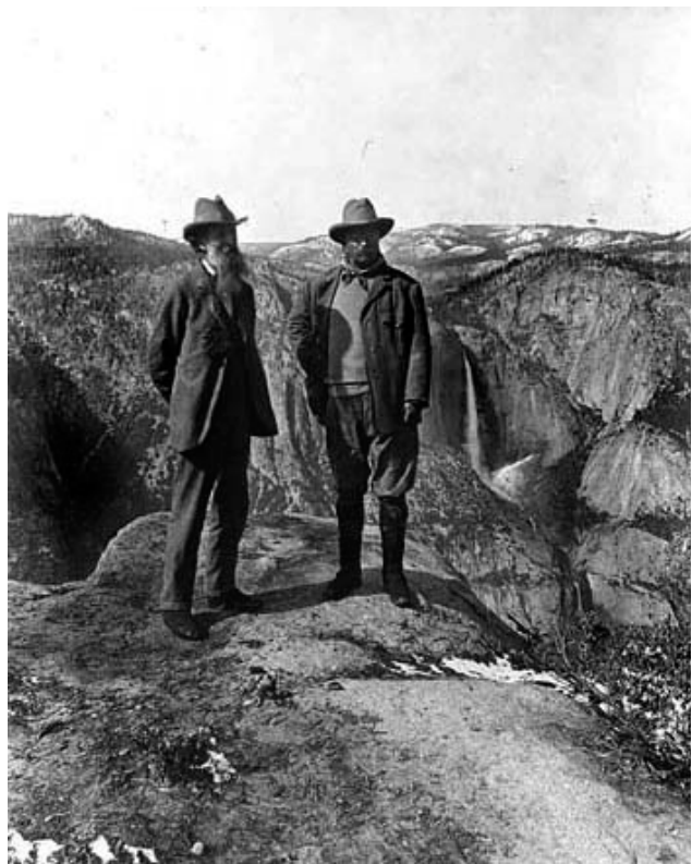
Explorer John Muir (left) and Theodore Roosevelt at Yosemite, c. 1906.

Right: Report of the National Conservation Commission, 1909.