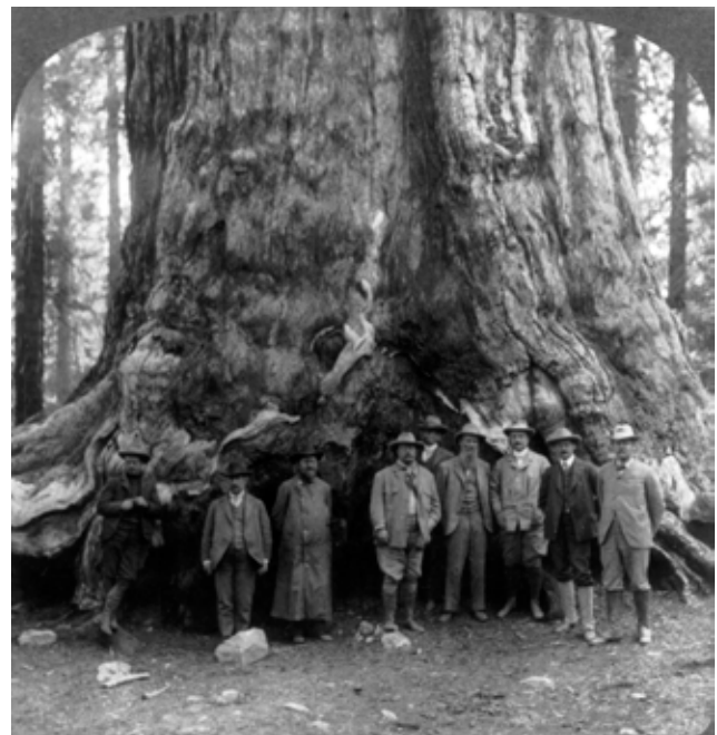
Theodore Roosevelt in California, c. 1903.

In 1872, Congress ordered that the Yellowstone country of Wyoming and Montana be set aside "as a public park or pleasuring-ground for the benefit and enjoyment of the people." In the next several decades, Congress created other national parks, such as Yosemite and Mount Rainier. Congress was motivated by two goals, which were not seen at the time as necessarily conflicting: preserving nature and promoting tourism.