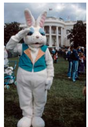
(l to r) Easter Monday on the White House grounds, 1887, Children with Maypole at Egg Roll, c. 1920, Easter Bunny salutes officers in parade, 2002