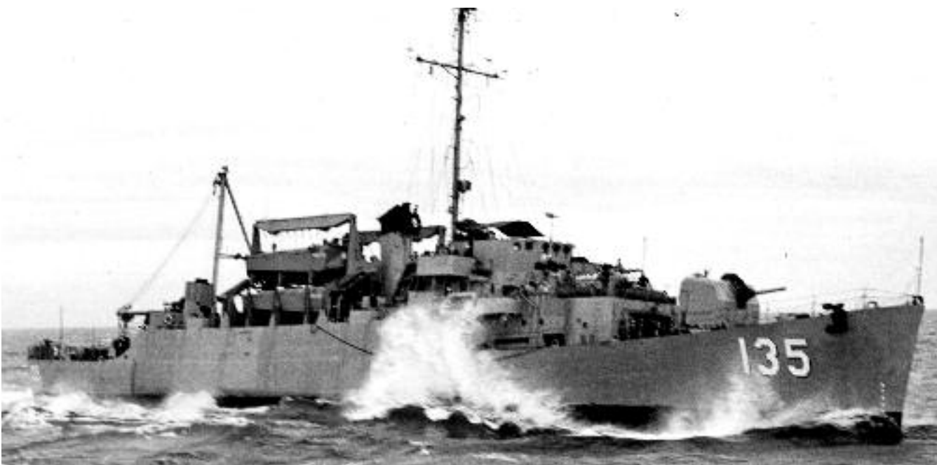
Opposite: The USS Weiss in rough seas on August 20. The storm prompted a change in course toward Bermuda.