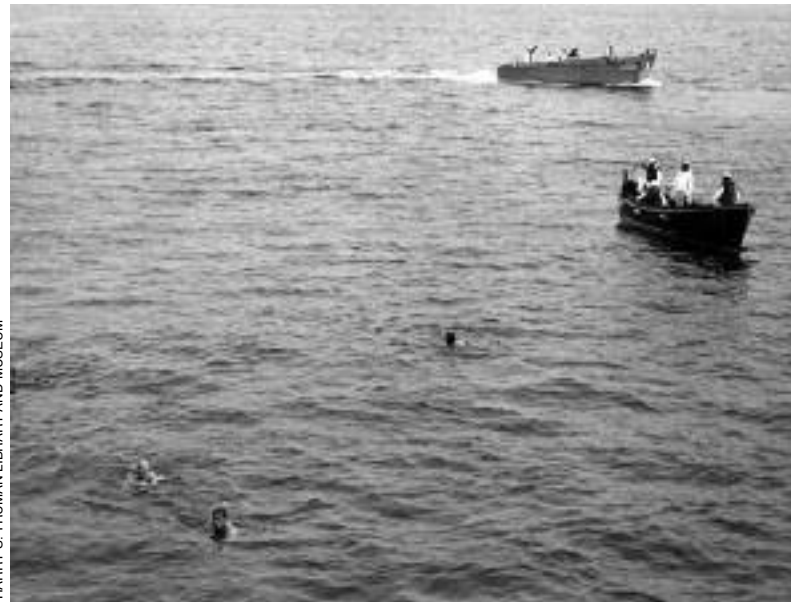
HARRY S. TRUMAN LIBRARY AND MUSEUM

Truman and his companions embarked from the Washington Navy Yard on the afternoon of August 16 in drizzling rain after posing for photographs on the Williamsburg ’s quarterdeck. The first two days of the cruise were uneventful. Truman napped, swam, read ( The Life of Grover Cleveland and The Age of Jackson ), watched movies, and generally relaxed. Ross told reporters the president “would make no public appearances . . . [or] speeches.” Truman would go ashore “several times,” but the reporters could not report any details until he returned to the yacht. The president also asked that naval ceremonial be kept to a minimum except in the case of the USS Missouri . If the Williamsburg